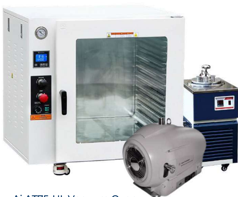
Ai AT75-UL Vacuum Oven Agilent IDP-15 Vacuum Pump Ai T40x-UL Cold Trap