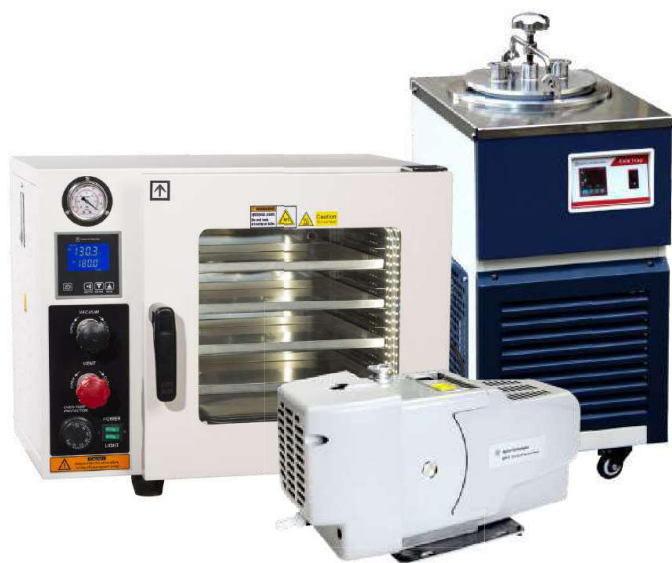
Ai AT09-UL Vacuum Oven Agilent IDP-3 Vacuum Pump Ai T40x_UL Cold Trap