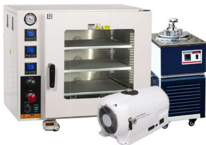
Ai AT32-UL Vacuum Oven Agilent IDP-7 Vacuum Pump Ai T40x-UL Cold Trap