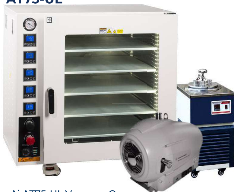
Ai AT75-UL Vacuum Oven Agilent IDP-15 Vacuum Pump Ai T40x-UL Cold Trap