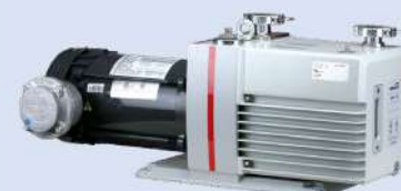
Welch CRVPro 16