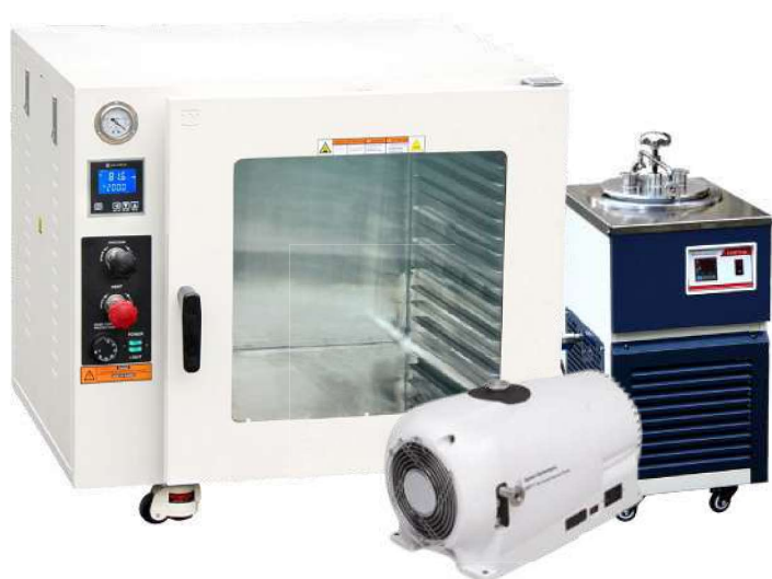
Ai AT50x Vacuum Oven Agilent IDP-7 Vacuum Pump Ai T40x-UL Cold Trap