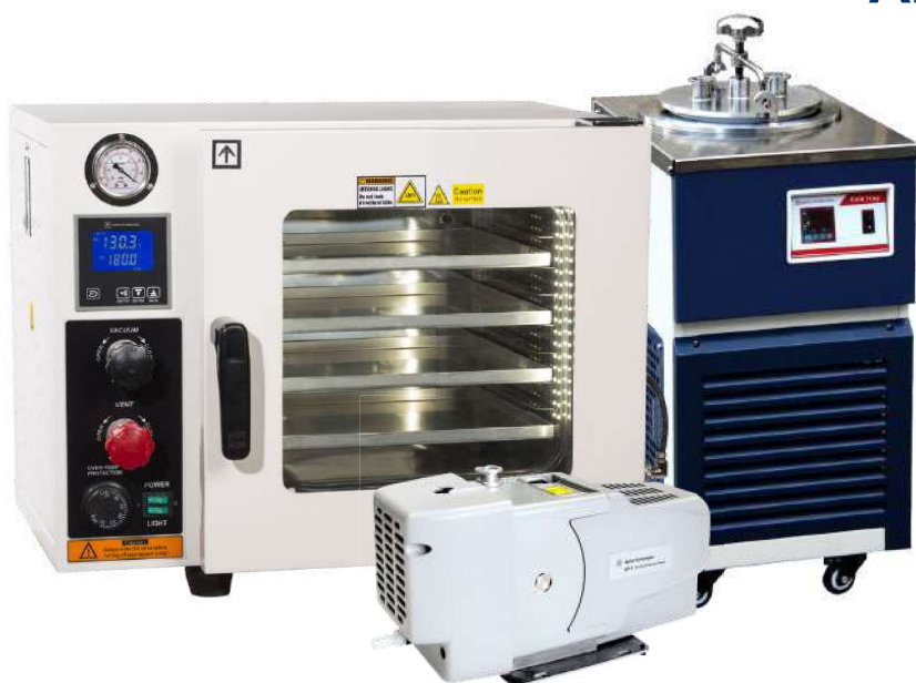
Ai AT19-UL Vacuum Oven Agilent IDP-3 Vacuum Pump Ai T40x_UL Cold Trap